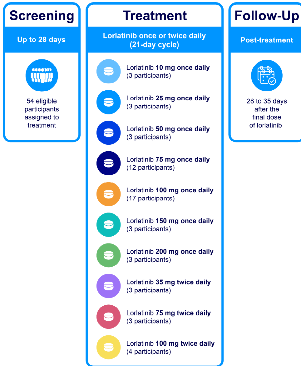
Figure 1. Study schema for Phase 1